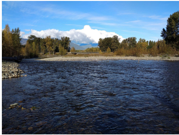
Figure 1 Sampling Location for the 2025 CABIN Benthic Invertebrate Sampling