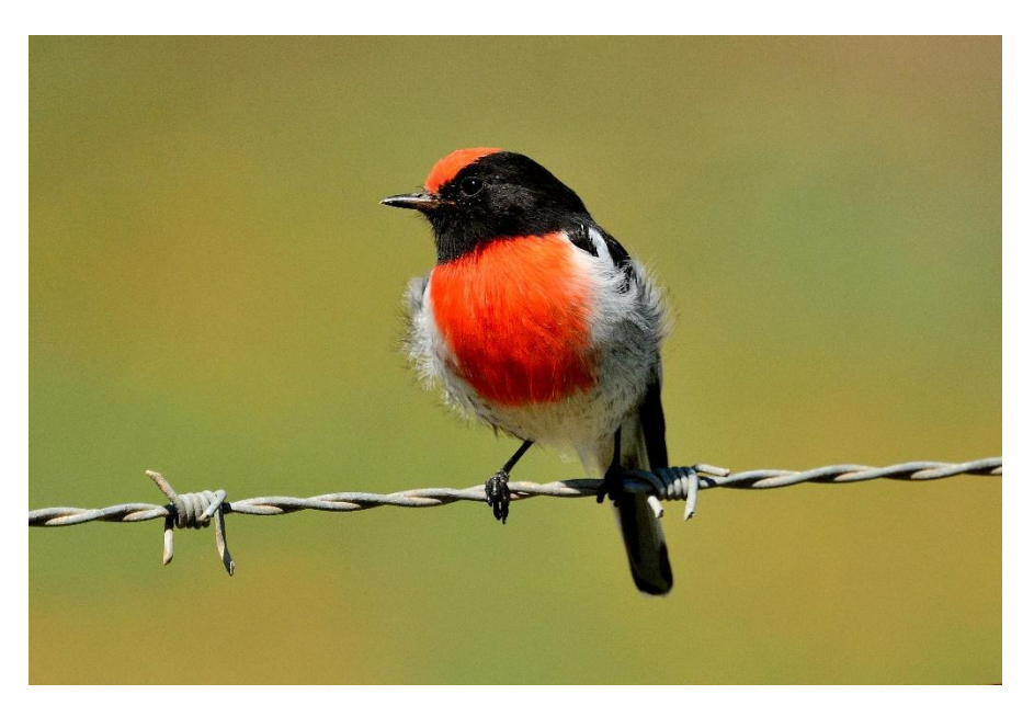
Red-capped Robin