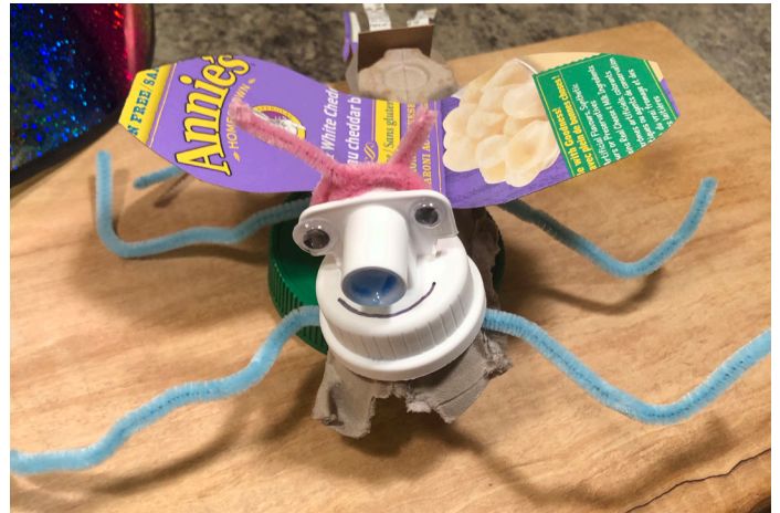
Build your bug with recycled (above) or natural materials (below).