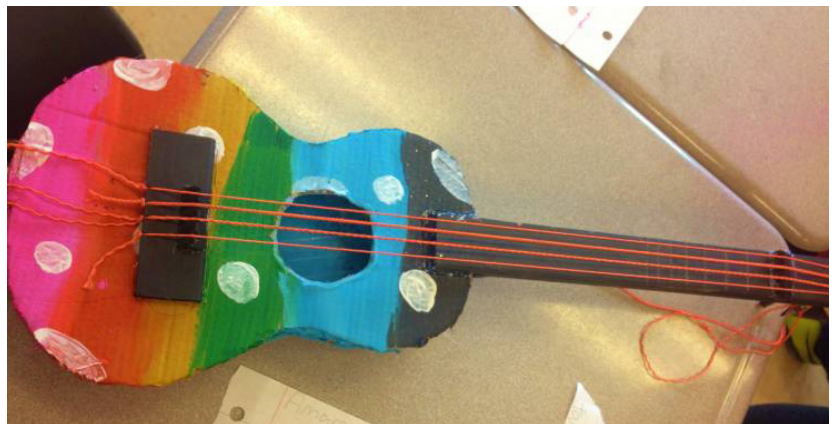
A colourful cardboard and string guitar, made from a creative student in Wildsight's Beyond Recycling program.