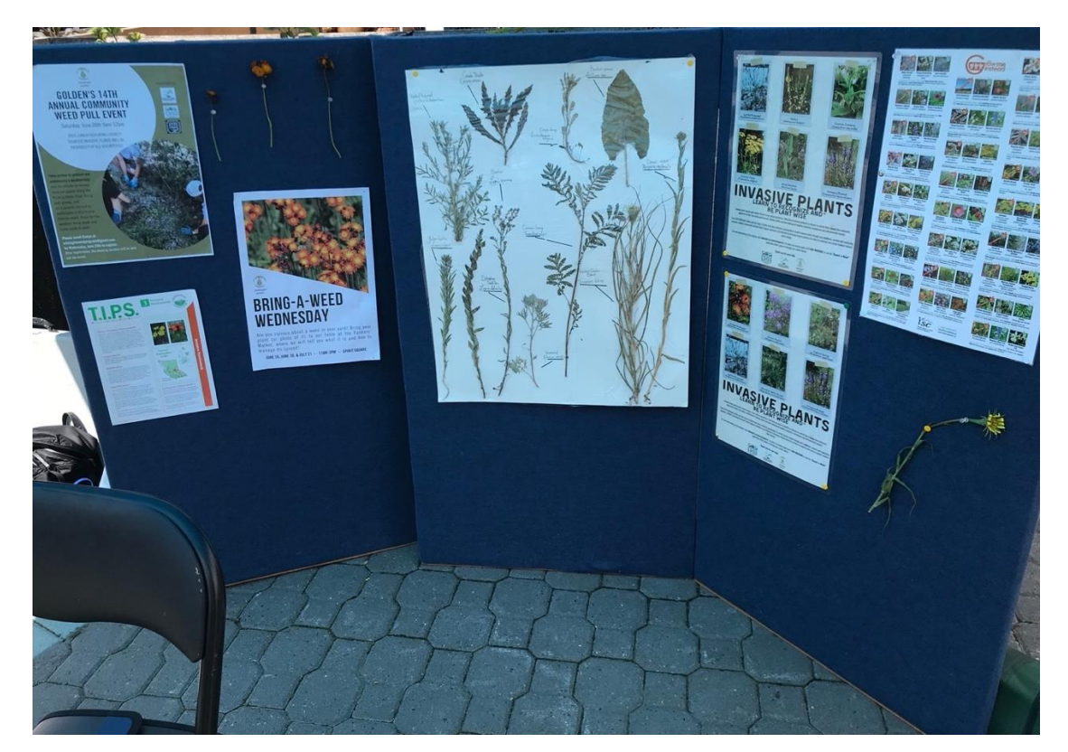
Figure 4: The invasive plants display at the Farmers' Market.

A visual display of invasive plants was set up at the vendor table, including a vase of fresh-cut invasive plants, brochures, invasive plants posters (see Figure 4). These visuals attracted interest, which led to conversation, especially for individuals who recognized Orange Hawkweed and wanted to learn more about non-toxic management strategies. On average, 20 individuals stopped by the table on Market days to ask about invasive plants and other Wildsight Golden programs.