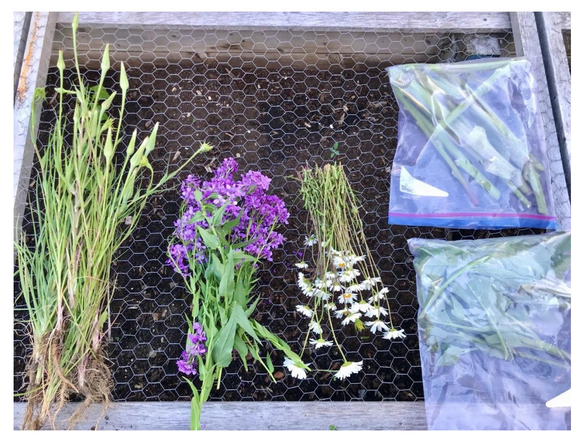
Figure 7: Harvested invasive plants for the edible weeds lunch at the Community Weed Pull

At the Community Weed Pull events, Wildsight Golden provides volunteers with free lunch to thank them for their hard work. Last year, the coordinator for the 2020 CIPP season established a relationship with The Columbia River Catering Co. who provided the volunteers with an edible invasive plant lunch. The 2021 CIPP coordinator wanted to continue with the edible weeds lunch and contacted The Columbia River Catering Co. to arrange catering services. Invasive plants were harvested through the CIPP (see Figure 7) and provided to The Columbia River Catering Co. several days in advance.