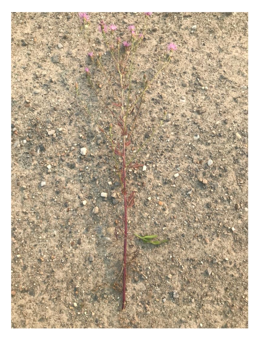
Figure 3: Less biomass on Spotted Knapweed plant, which is biologically controlled by Cyphocleonus Achates .