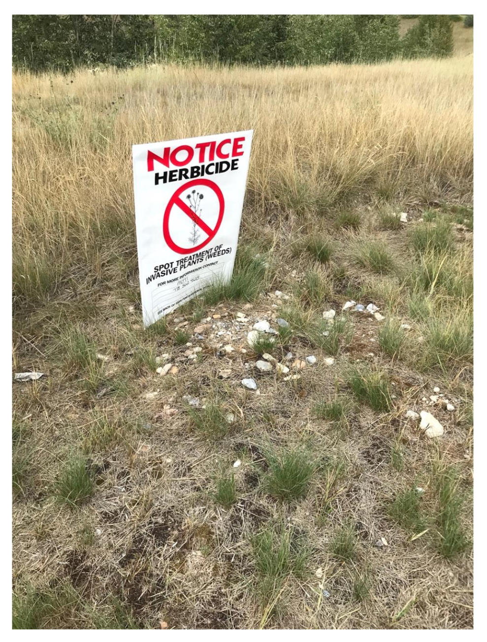
Figure 1 : Herbicide signage found on CIPP high-priority sites.

CIPP coordinator that she would not be working in those chemically-treated zones to avoid exposure to residual toxins; this was a significant setback for the CIPP's non-toxic invasive plant management efforts.