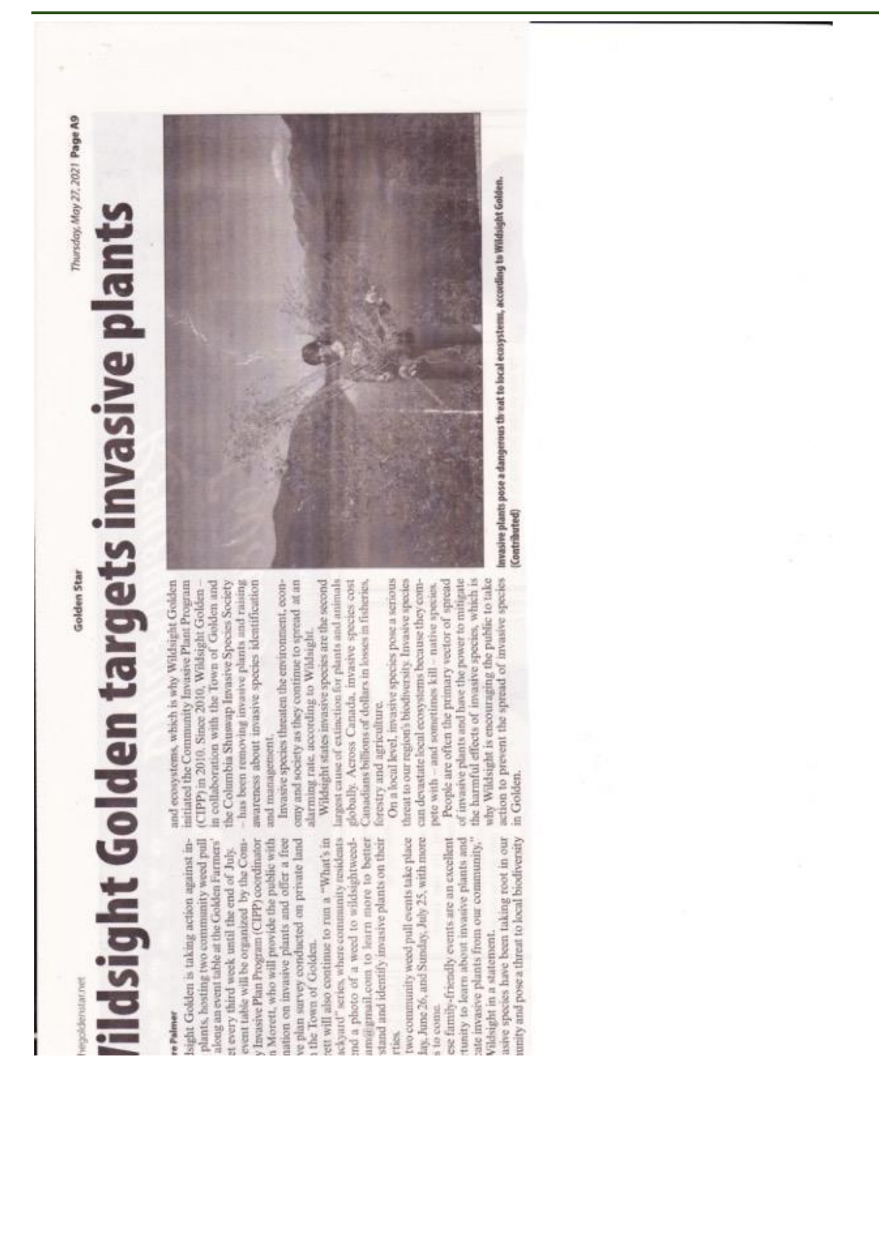
Appendix E. Article in Golden Star