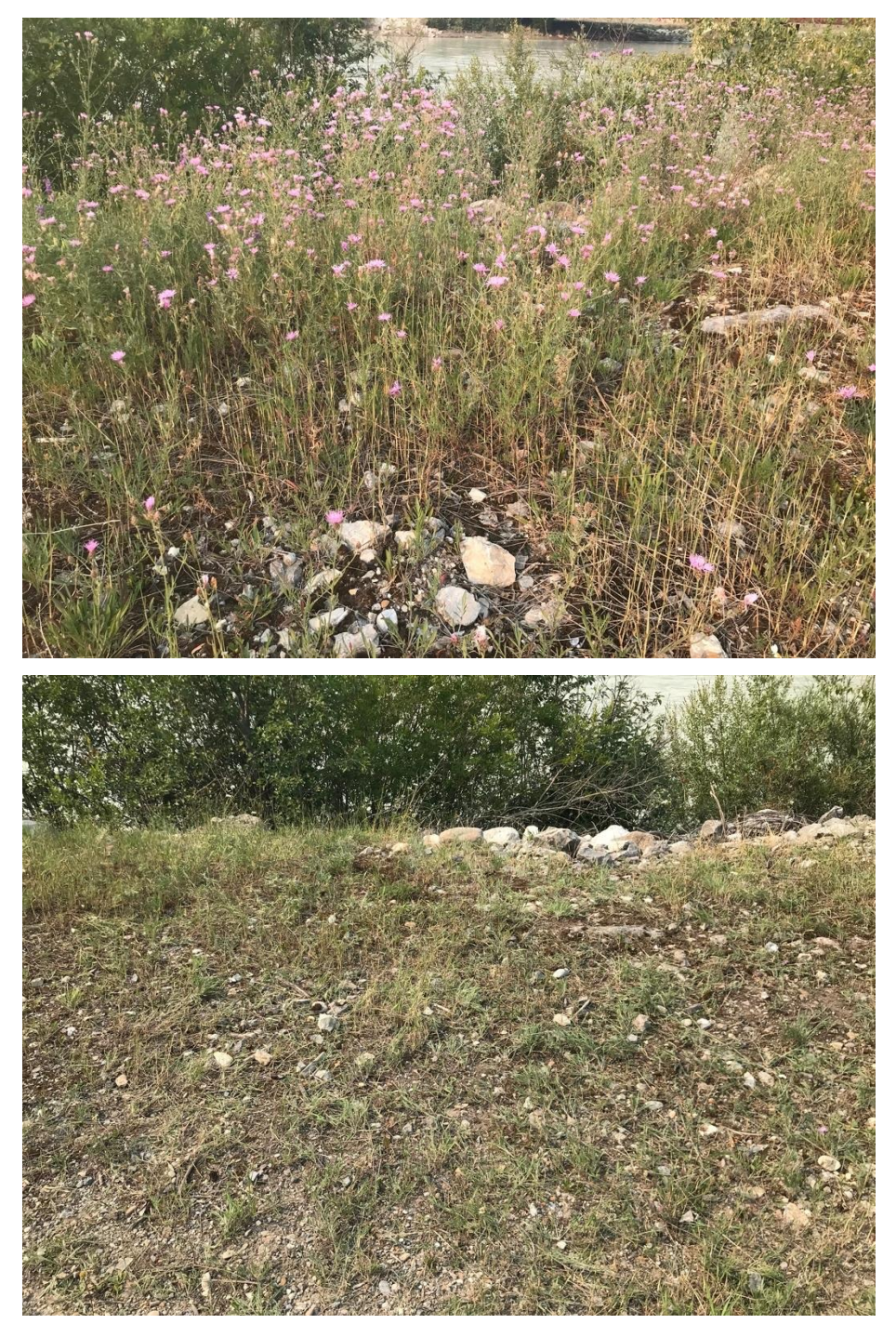
Figure 2: Before and after photos of removal of Spotted Knapweed.