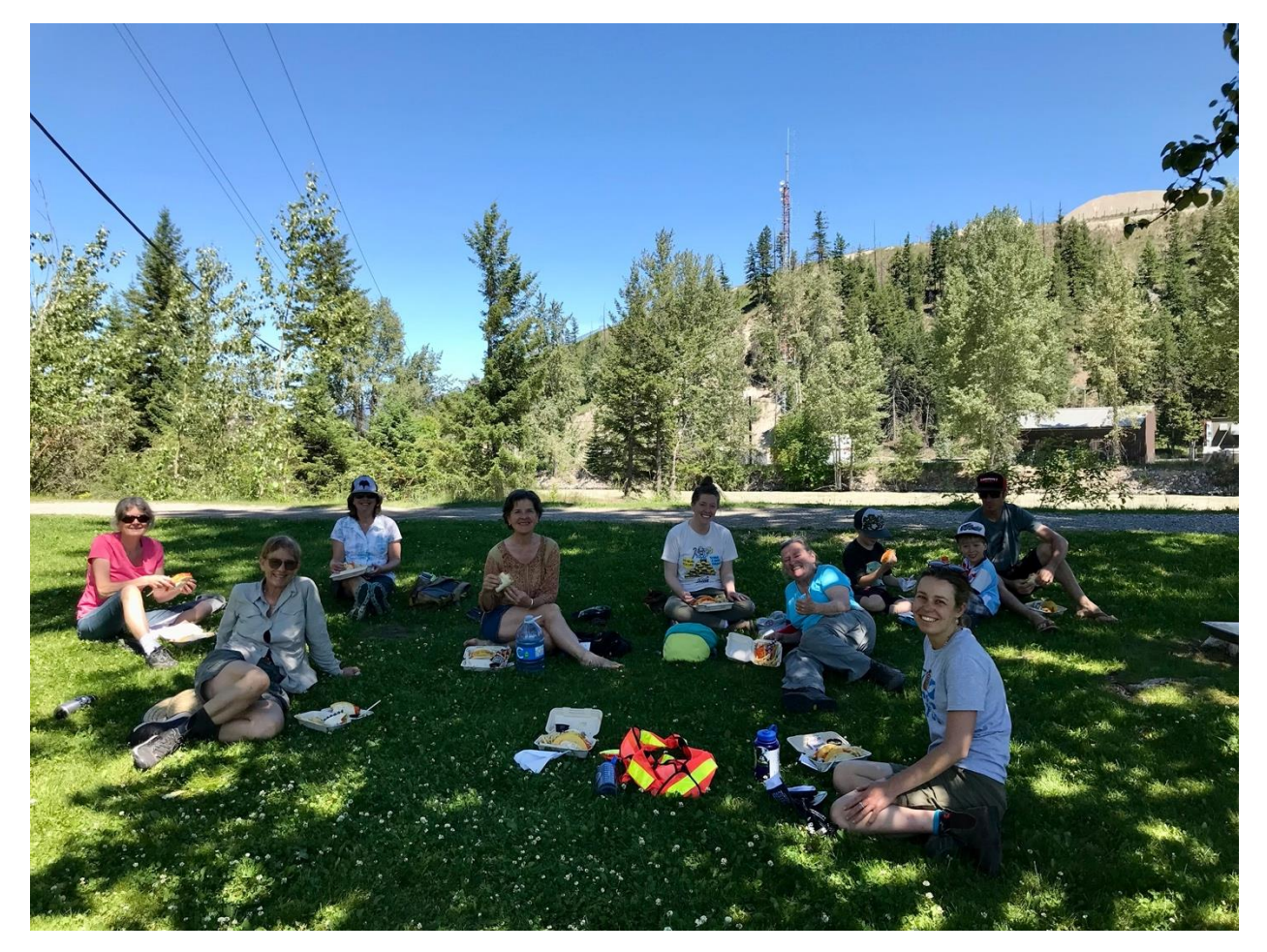
Figure 8 : Volunteers enjoying the lunch featuring edible invasive provided by Columbia River Catering Co.

On the day of the 14th Annual Community Weed Pull, the volunteers met at Kumsheen Park. The event included a brief introduction to the invasive plants that were to be targeted, and best management practices for the invasive plants were shared during the weed pull. Following COVID-19 guidelines, each participant sanitized their hands and any tools shared with hand sanitizer. As an additional safety measure, the participants were asked to bring their personal garden gloves to the event. Seventeen volunteers attended the Community Weed Pull, and a total of 16 bags of invasive plant material were removed from along the Kicking Horse River at this event. At the end of the Weed Pull, the volunteers enjoyed a taco lunch featuring edible invasive plants provided by the Columbia River Catering Co (see Figure 8).