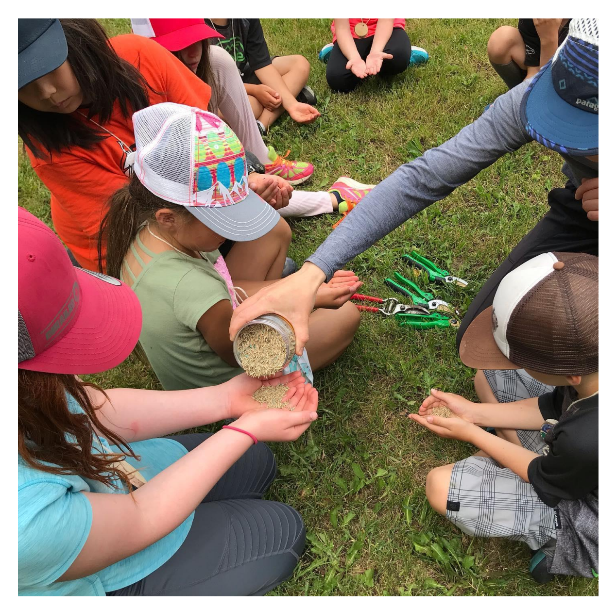
Figure 5: Kids at Get Wild Camp helping with native grass restoration (Corrigan, 2021).

component. At times, the weather conditions (heat, smoke, strong winds) or mosquitoes made it challenging to sustain weed pulling efforts. Kids enjoyed restoring the area after the weed pulls (see Figure 5). Native grasses and Yellow Mountain Avens ( Dryas drummondii ) were used for restoration. On one occasion, kids created native seed balls with a mixture of clay, soil, and native seeds to restore the Golden Dog Park.